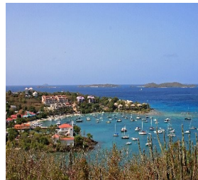
View of Battery and Cruz Bay from North Shore Road

In 1825 the Danish government opened a new courthouse and prison in Cruz Bay. The structure was intended to improve the treatment of slaves on St. John, by making justice a government issue rather than leaving it to individual planters. This building is now known as the Battery and is one of the only buildings remaining from the Danish Colonial period.